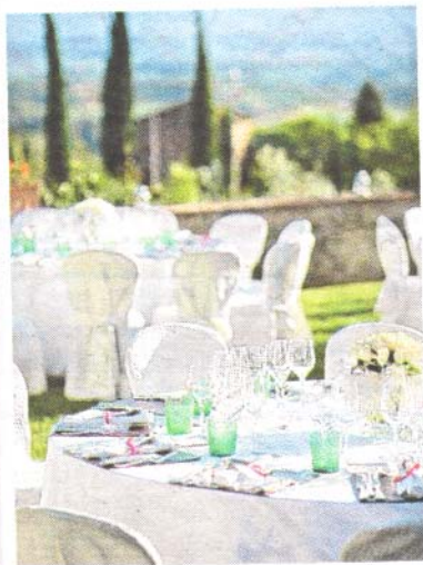
RECEPTION | Castello di Tavolese

turning to the castle for the reception.