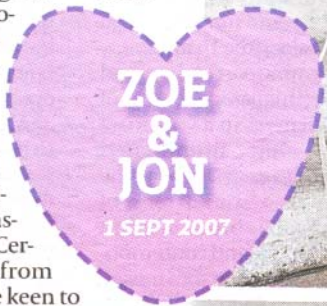
BIG DAY | Tying the knot in Tuscany